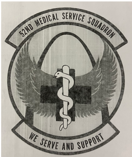
52 Medical Service Squadron emblem

52 Medical Service Squadron emblem: A disc divided white and blue by a yellow lightning bolt arched from the dexter top to sinister base, on the white a red cross couped charged with a vertical red entwined by a serpent all silver grey, on the blue three stylized gray wings all within a yellow border. Below a white scroll bordered yellow. SIGNIFICANCE: The emblem is symbolic of the squadron its mission. The blue field with the stylized flight symbols represents the sky, the primary theater of Air Force operations and the unit's aerospace medical mission. The lightning bolt depicts strength and speed with which the unit reacts in performing its primary mission. The field of white signifies the purity of medicine and the red Geneva Cross and staff of Aesculapius represents the medical profession. The emblem bears the Air Force colors ultramarine blue and gold yellow and national colors red, white, and blue.